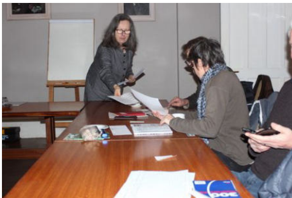
Getting to grips with the nitty gritty

There was also considerable coverage of pest management - including European and Asian Hornets. We were all encouraged to visit the National Bee Keeping Unit website to find out more about setting up Asian Hornet traps as a precautionary measure - after all, it is us beekeepers who are going to be the first