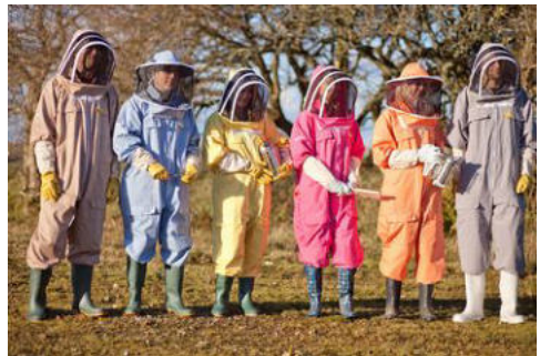
A full spectrum of bee suits is available from BBwear

To see the range of products, their web site is http://www.bbwear.co.uk/ .