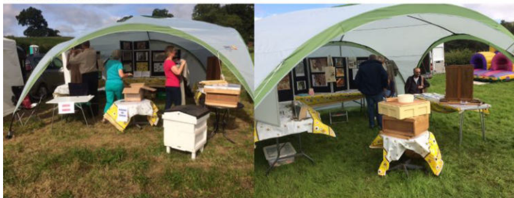
The MBKA display stand at shows in years past - note that we do seem to attract excellent weather!

Montgomery Carnival starts from the show ground at 12 noon, followed by the show itself from 1pm till 5pm. MBKA will be there stimulating public interest in bees.