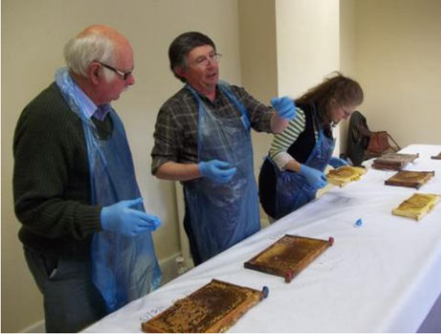
Inspecting an invisible comb?

The National Bee Unit (NBU) Wales will be running four Bee Health Days in June with a presentation for beekeepers looking at bee health and good practice, and at Henfaes and the National Botanic Gardens beekeepers will have an opportunity to join in an inspection at the apiary, where we will demonstrate inspecting hives the NBU way.