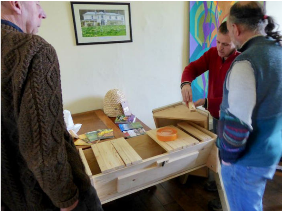
The top bar hive production team at work (is this one is open for discussion? Ed)

Llanidloes was the venue for the first 2019 meeting of Gwyllo'r Gwenyn (Watching the Bees). The group was set up in 2018 by beekeepers with a special interest in the methods of the natural beekeeping movement. Its very first meeting was held in Machynlleth, as a result of the desire of attendees of a 2-day training workshop - held in June at Y Plas, Machynlleth - to keep in touch with each other, and to meet again from time to time for mutual support and to compare notes. The training had been delivered by John <> ( http://topbarbeehive.co.uk ) who in the Autumn of that same year kindly travelled down from his Yorkshire home once more to give a very interesting evening presentation to the MBKA at Plas Dolerw. Partly as a result of the success of that presentation several MBKA members were in attendance of the February meeting in Llanidloes, where they found much to discuss and debate.