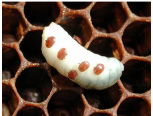
Varroa mites on a honeybee larva

From 10am to 5pm with the Conwy BKA. The venue is Henfaes Research Centre, Abergwyngregyn,