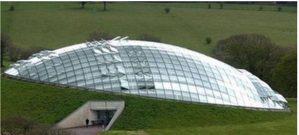
National Botanic Garden Wales, the giant bee eye greenhouse

Entrance to the Botanic Gardens is £10.45 (or £7.50 each for groups of 10 or more, you book on 01558 667148). The NBU Bee Health event is no extra charge, the gardens have a lot to offer if you make a day of it, they are well worth supporting.