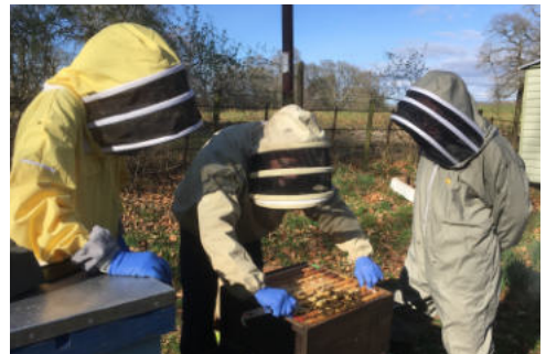
First Spring inspection

The colonies went into the winter period in a good healthy condition, mouse guards fitted, queen excluders removed and fondant feed in place on those hives requiring additional food. During November the team took the opportunity to tidy up the apiary, raking the leaves and levelling off some of the uneven ground. Spring bulbs have been planted and there are plans to plant a number of 'bee friendly' plants ahead of the spring. Further plans are already being formulated for 2021 with Ferol Richards tasked to revamp the visitor shelter.