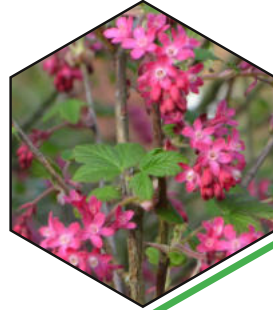
Flowering Currant Ribes sanguinum

This is the season for flowering trees and shrubs. All the Prunus species are good. Plum both wild and cultivated, damsons, cherry, almond – you can't go wrong; and there can be the bonus of fruit later in the year.