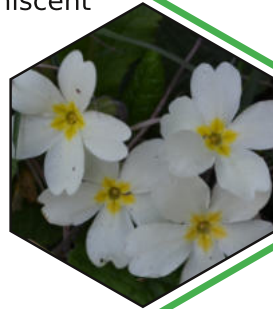
Primrose Primula vulgaris

Native plants providing a useful source of pollen and nectar are the cowslip ( Primula veris ) and the primrose ( Primula vulgaris )