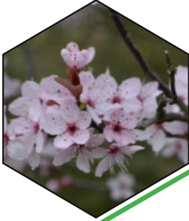
Plum blossom Prunus cerasifera

It would be easy to provide a list of plants that are welcomed by pollinators at this time of year, but that's not going to make for a very interesting read, so I'll stick to some pictures and a few broad principles.