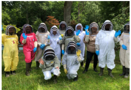
Class of 2020 graduating after lockdown