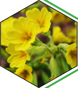
Cowslip Primula vera

Easy to grow flowering shrubs include the flowering currant ( Ribes sanguineum ), though the smell is said to be reminiscent of cat's pee!