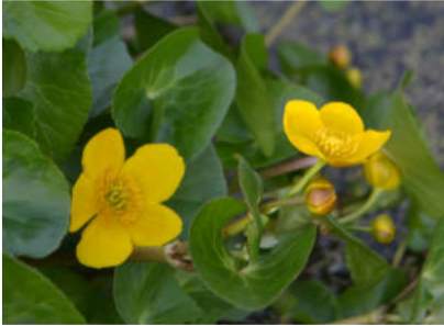
Marsh Marigold Caltha palustris

For those of you with a pond or a boggy bit in your garden the marsh marigold ( Caltha palustris ) can look spectacular, but stick to the single native form. The double variety is not so attractive to pollinators.