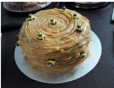
Let there bee cake

better than traps which kill insects, as once identified, the hornet can be released by a team of bee-inspectors and enable them to find the nest. So rather than killing one or two insects, the whole nest can be destroyed.