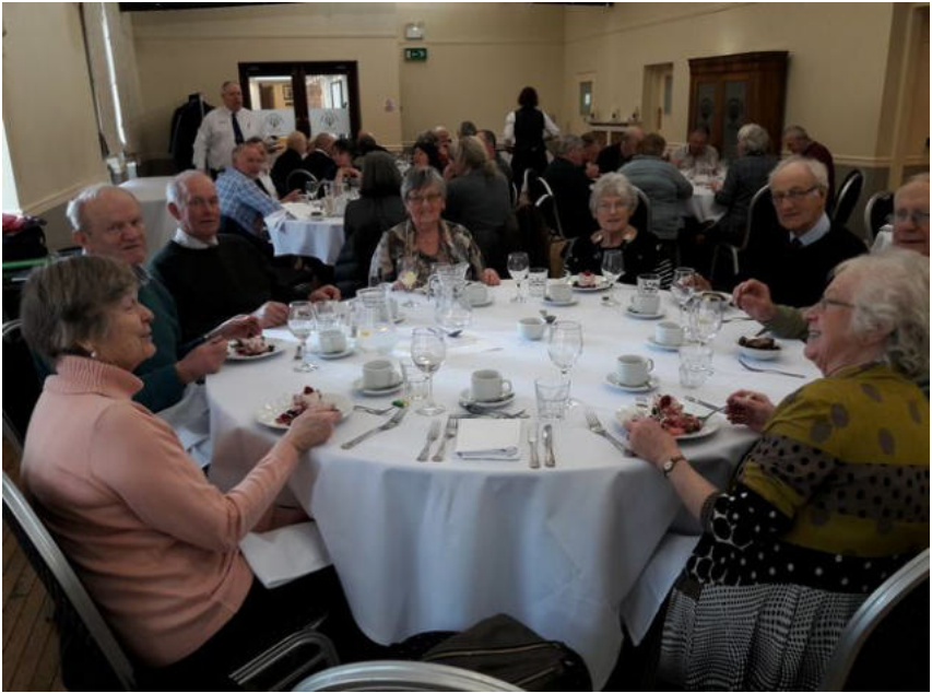
Table Four at the annual meal