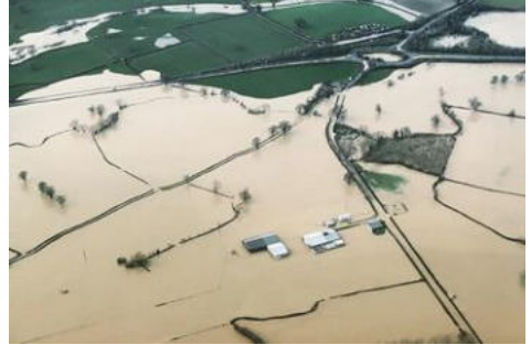
A Welsh pool near Welshpool