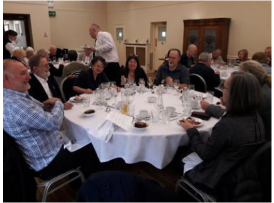
An Irishman, a Welshman and a bee go into a bar ...