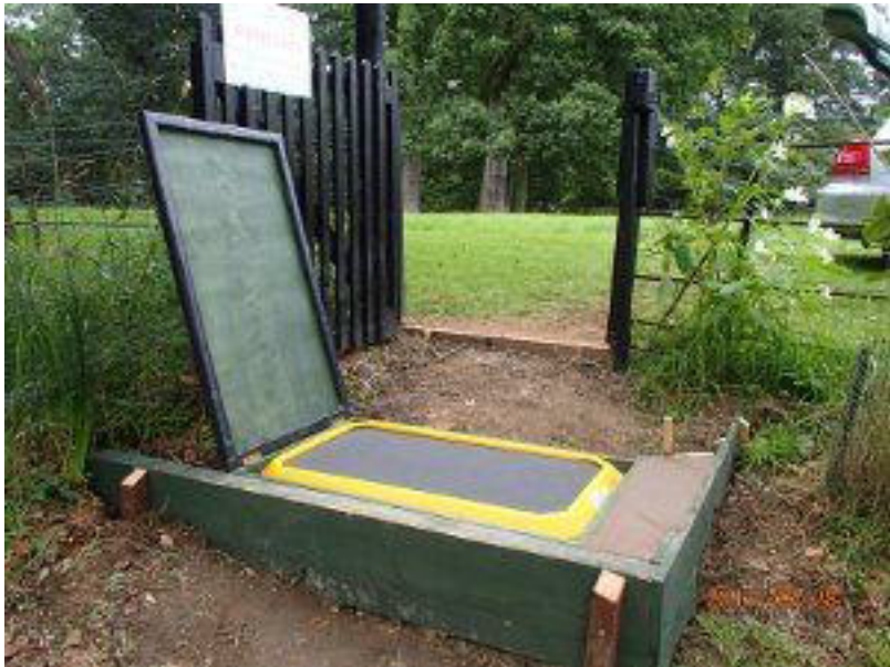
Ian's ingenious portable biosecurity mat unveiled