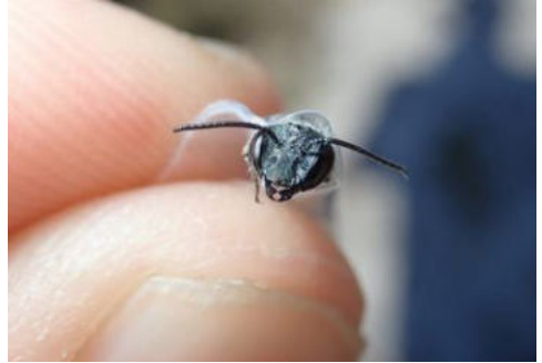
Blue bee - just its head, really

First described in 2011, scientists weren't sure the blue calamintha bee still existed. The species had only been recorded in four locations totaling just 16 square miles of pine scrub habitat at Central Florida's Lake Wales Ridge.