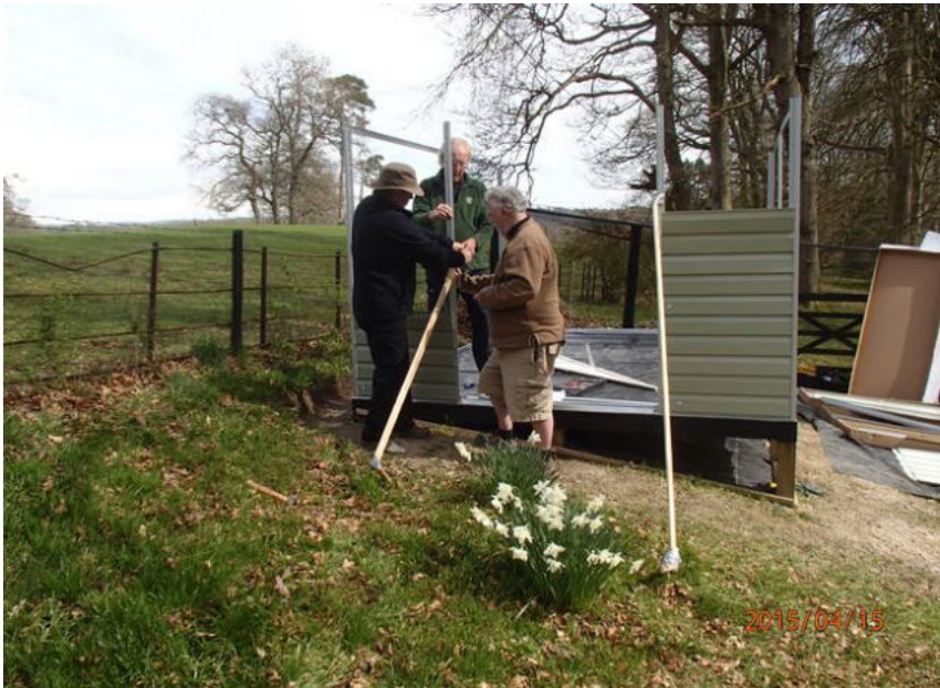
Shy and retiring as ever, Ian is behind the camera for the great shed erection of 2015 The BeeHolder