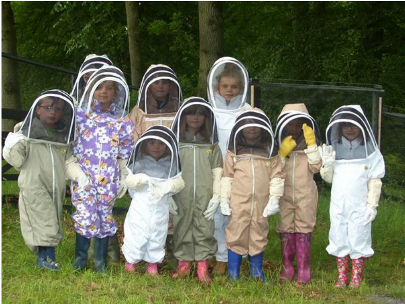
A blast from the past - does anybody recognise any of these from the class of 2012?